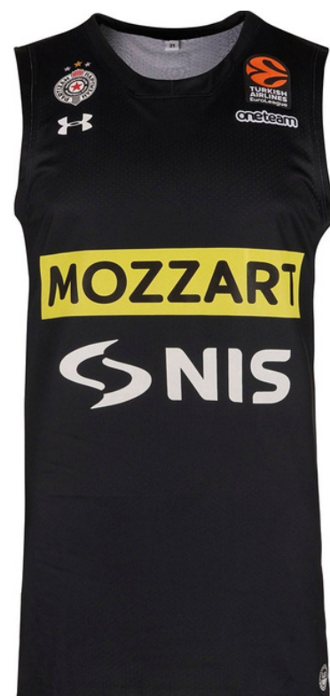
*All stats as of 2/8/23

In The Playbook , we explore the strategies, numbers, and personnel behind their turnaround and what is needed for a successful playoff push.