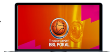
BBL Pokal Highlights